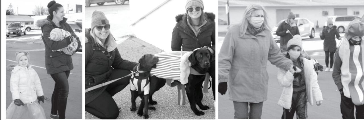
Families and pets braved the cold morning temperatures to walk in the parade. • Hotel Transylvania held at the Harlan Theatre was a great place to warm up following the parade.