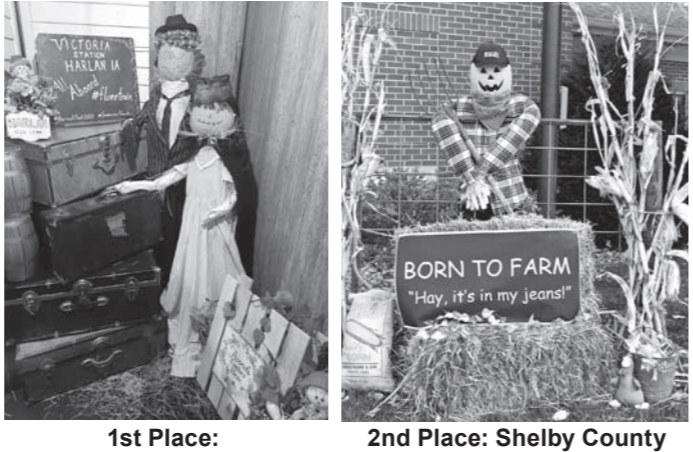
1st Place: Victoria Station Restaurant 2nd Place: Shelby County State Bank, Dwtn. Harlan