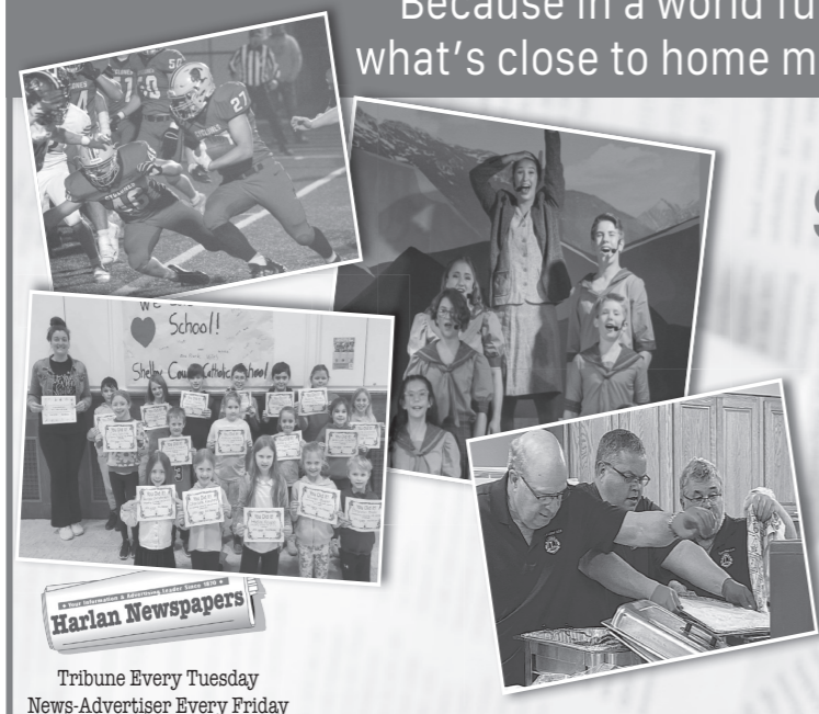
Tribune Every Tuesday News-Advertiser Every Friday

Electronic Edition Only $4.95/year for print subscribers, $39.95 for non-subscribers.